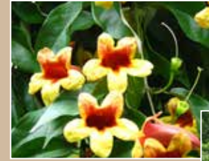
crossvine ( Bignonia capreolata )-OH