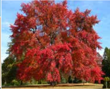
black tupelo ( Nyssa sylvatica & CVs)-OH