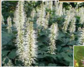
bottlebrush buckeye ( Aesculus parviflora )-US