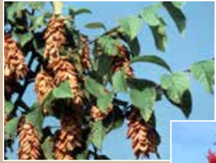
American hop-hornbeam ( Ostrya virginiana )-OH