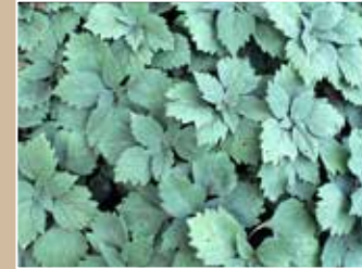
Allegheny pachysandra ( Pachysandra procumbens )-US