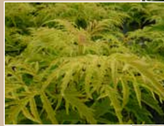
Lemony Lace™ elderberry ( Sambucus racemosa )-CV