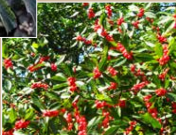
common winterberry ( Ilex verticillata & CVs)-OH