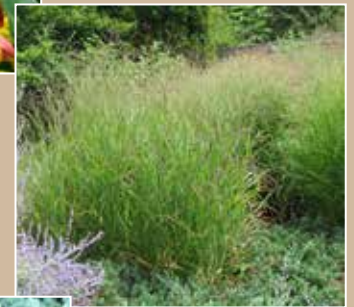
switch grass ( Panicum virgatum )-OH