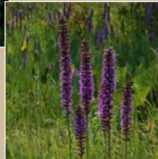
spiked blazing-star ( Liatris spicata )-OH