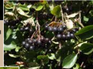
black chokeberry ( Aronia melanocarpa )-OH