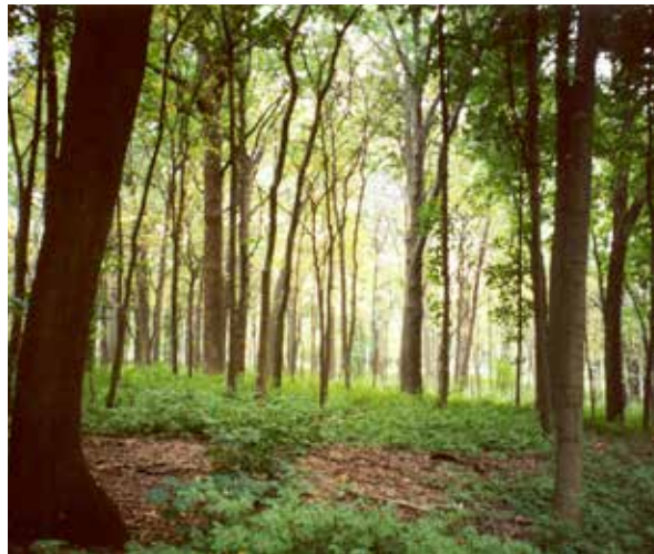
Restored woodland in a Hamilton County park after removal of Amur honeysuckle

Ohio Nursery & Landscape Association represents the interests of Ohio's nursery, garden center, and landscape industry. www.onla.org ; 614.889.1195; info@onla.org