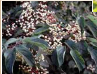
gray dogwood ( Cornus racemosa )-OH