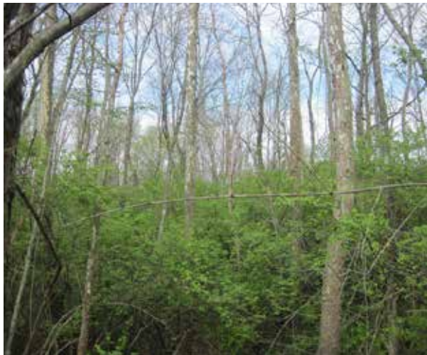
Woodland in a Hamilton County park with understory invaded by Amur honeysuckle