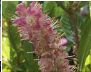
Ruby Spice summersweet clethra ( Clethra alnifolia & CVs)-US