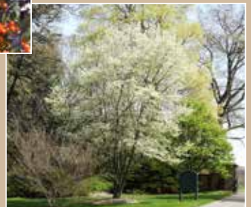
serviceberries ( Amelanchier spp.)-US/OH