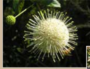
buttonbush ( Cephalanthus occidentalis )-OH