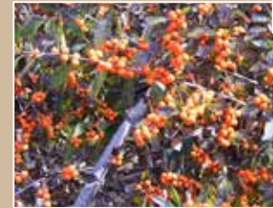
Winter Gold winterberry ( Ilex verticillata )-CV