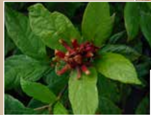
sweetshrub ( Calycanthus floridus )-US