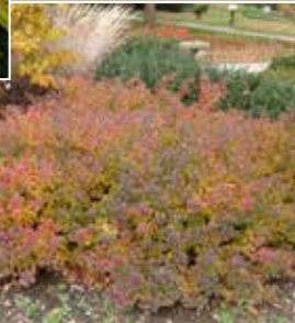
Tor birchleaf spirea ( Spiraea betulifolia 'Tor')-CV