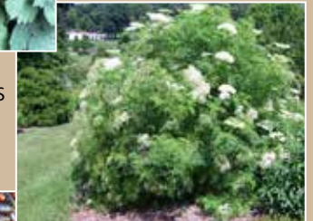
cutleaf elderberry ( Sambucus canadensis 'Laciniata/Acutiloba')-CV